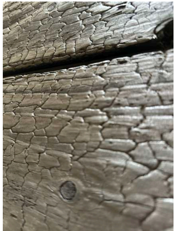
Image 3. Deep char cladding

Inflamed's more intensely charred finishes necessitate less maintenance compared to brushed finishes where more of the natural wood is visible. Our charring process contributes to the wood's durability, extending the time between finish reapplication. However, the charred layer will naturally weather over time. It's typical for this charred layer to experience weathering or minor damage as time goes on. This contributes to the unique character of the product, embracing the Japanese concept of 'Wabi-Sabi,' which elaborates the beauty of ageing and imperfections.