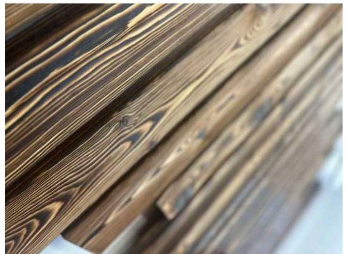
Image 2. Brushed charred wood cladding

If regular maintenance is delayed or if other damages have occurred, further steps might be necessary to restore the cladding to its original condition.